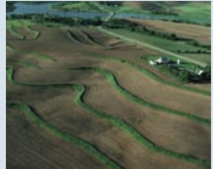
Figure 3. Contour terraces.