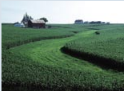
Figure 2. Grassed waterway.